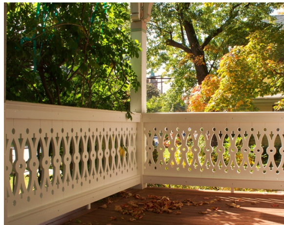
Examples of Queen Anne Balusters installed with wood railings (left) and PVC railings (right).